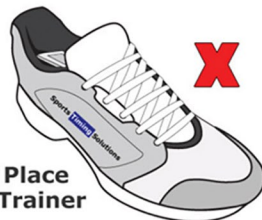
Do Not Place Inside Trainer