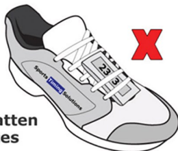
Do Not Flatten Under Laces

*Failure to attach your timing chip correctly could affect your results